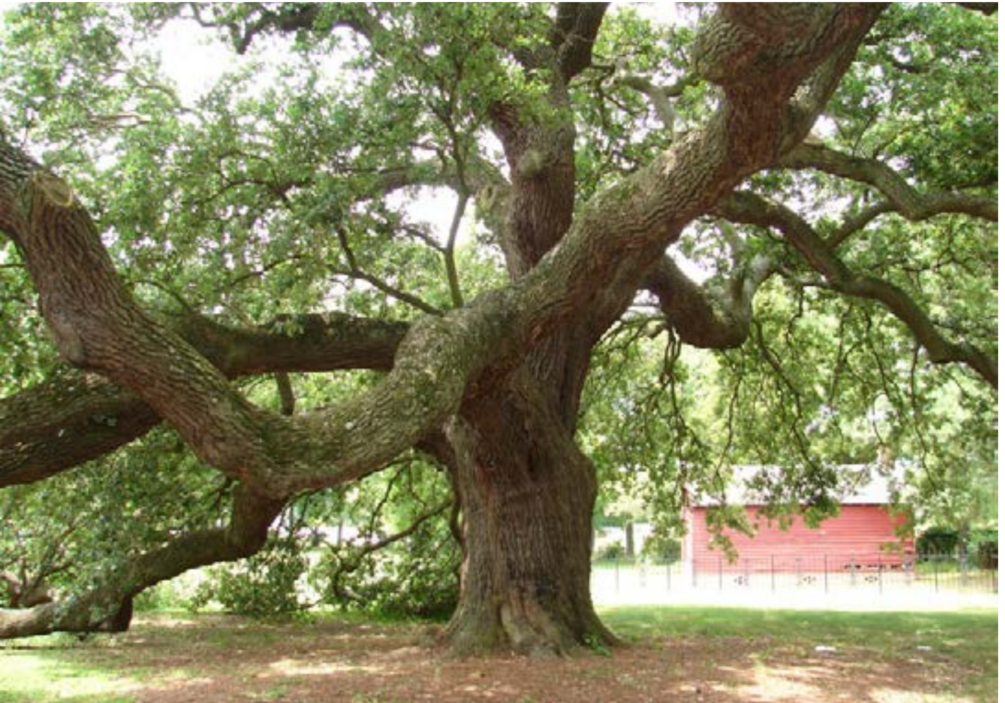
Emancipation Oak on the Campus of Hampton University