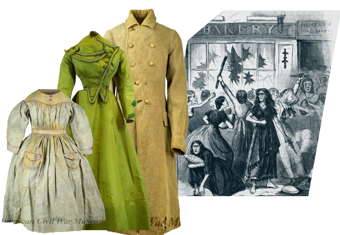
EXHIBIT: Richmonders at War

When Richmond, VA became the capital of the Confederate States in 1861, capturing the city became the primary objective of United States armies. What happens when wars come home?